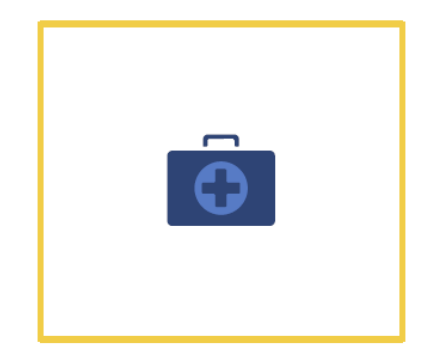
Access to Care