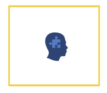
Increasing Rates of Mental Illness and Substance Disorders