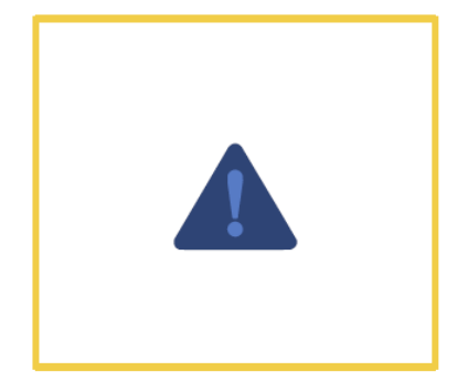
Poor Health Outcomes